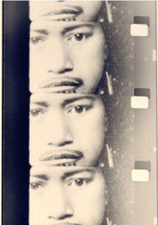
© Antje van Wichelen 2019, NOISY IMAGES – The exoticized other. Provenance original image Rautenstrauch-Joest Museum, Inv.no. 25